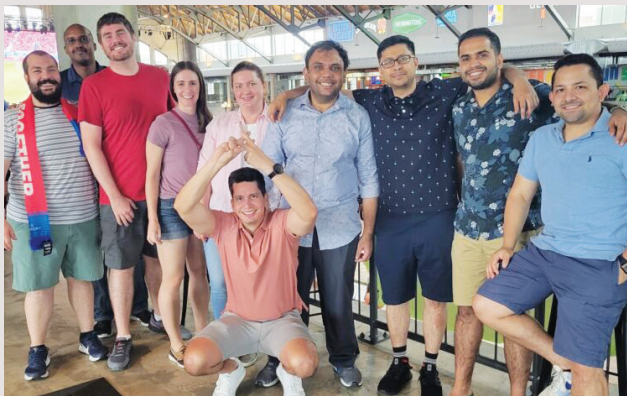
Some of our awesome current fellows in our Nephrology Fellowship Training Program!

As part of our commitment to maintain an educational environment most conducive to learning and physician well-being, we have further remodeled our fellows' area within the footprint of our Nephrology office space. An expanded workspace fills out the corner of our 8th floor, while a fully-stocked coffee-maker, refrigerator, and flat-screen TV adorn the fellows' dedicated breakroom. We have a dedicated "Zoom Room" for virtual conferences and a new call room complete with a memory foam mattress (size XL, to accommodate even our tallest fellows!). While afterhours calls are covered by a Night Float fellow and taken primarily as home call, having a dedicated space in which to relax within the immediate premises of the academic offices has been a much-welcomed addition by the fellows for those times when patient care has necessitated a return to the hospital.