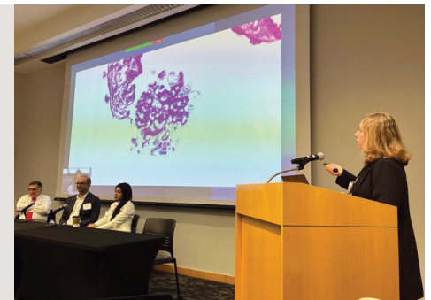
One of several panel discussions that were held during the Glomerular Diseases Symposium.